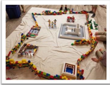
Good Friday 2019: Jerusalem in Lego helped us tell the story of Holy Week