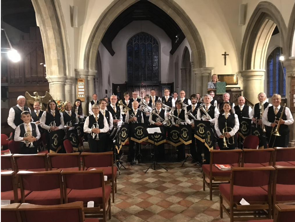
Hadstock Silver Band – 5 th October 2019 – Concert organised by The Friends