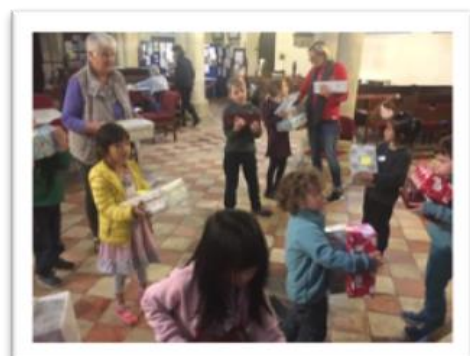
Shoebox Party October 2019: Packing boxes for Children in Distress in Eastern Europe

Please may I ask you to support and encourage the team in three ways?