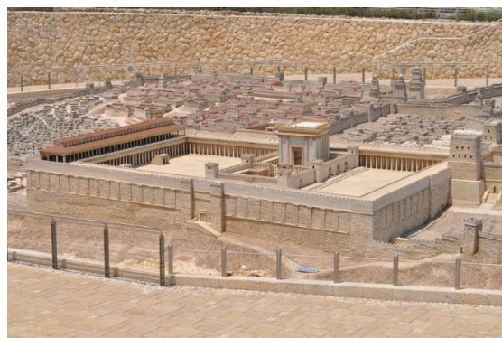
The Temple (Herodian)